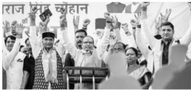
Madhya Pradesh Chief Minister Shivraj Singh Chouhan (pictured) at a public meeting in Bhopal on Wednesday. The BJP, which has had three OBC chief ministers in MP – Uma Bharti, Babu Lal Gaur and Chouhan – has given tickets to 71 OBCs, which is 31 per cent of its total candidates

The BJP and Congress leaders in MP have queued up in recent weeks to seek the blessings of Pandit Pradeep Mishra of Kubereshwar Dham in Sehore and Dharendra Krishna Shastri of Bageshwar Dham Peeth in Chhatrapur. The two seers, on the invitation of leaders from the Congress and the BJP, have visited towns