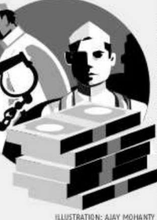
ILLUSTRATION: AJAY MOHANTY

Around 19 per cent of BJP, 17 per cent of Congress and 30 per cent of AAP's candidates have criminal cases. On the other hand, 299 or 25 per cent of total candidates are crorepatis. In 2018, out of 1,256 candidates, 285 or 23 per cent were crorepatis, according to ADR analysis. Data shows 86